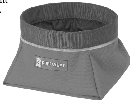
Quencher by Ruffwear®

Hydration on the trail is just as important for your dog as it is for you. For overall hydration, dogs require about one ounce of water per pound on a daily basis. When they are exerting themselves, they may require more. The weather may also be a factor to consider, as well, with warmer weather outings requiring more water. A collapsible bowl for water and food is a great choice for your hike. They are lightweight and are space saving.