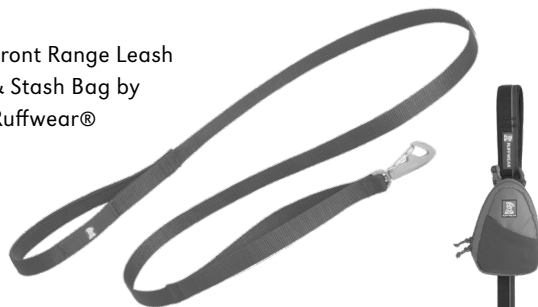
Front Range Leash & Stash Bag by Ruffwear®

you should be able to fit two fingers under the collar. Most hiking areas require a leash that is 6-ft. or less in length. Look for a leash with a secure collar attachment and a comfortable hand grip.